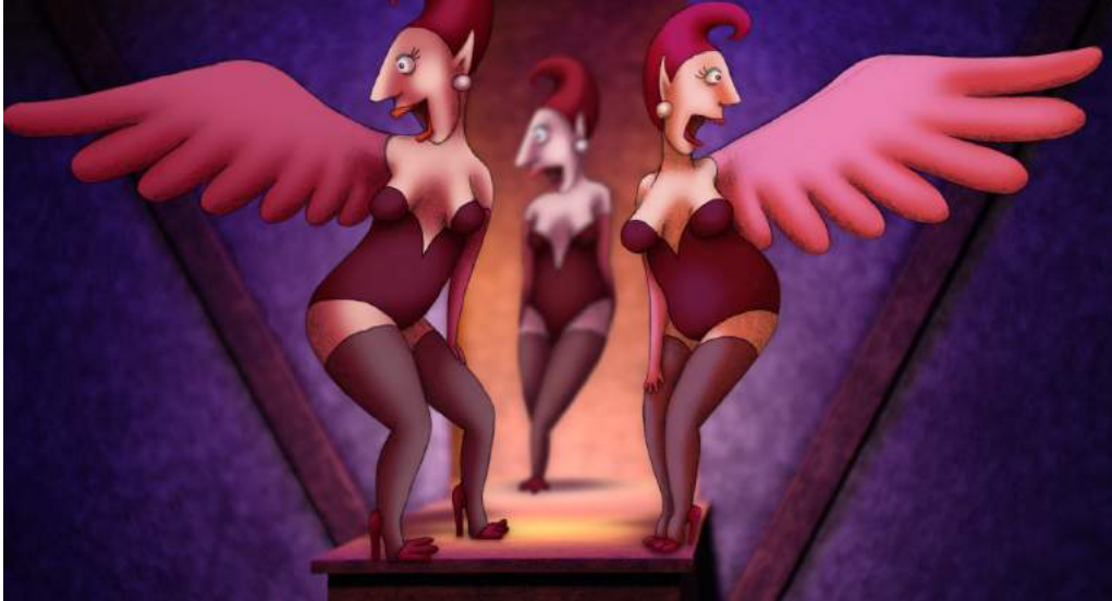
The three shape-shifting Mythology Sirens