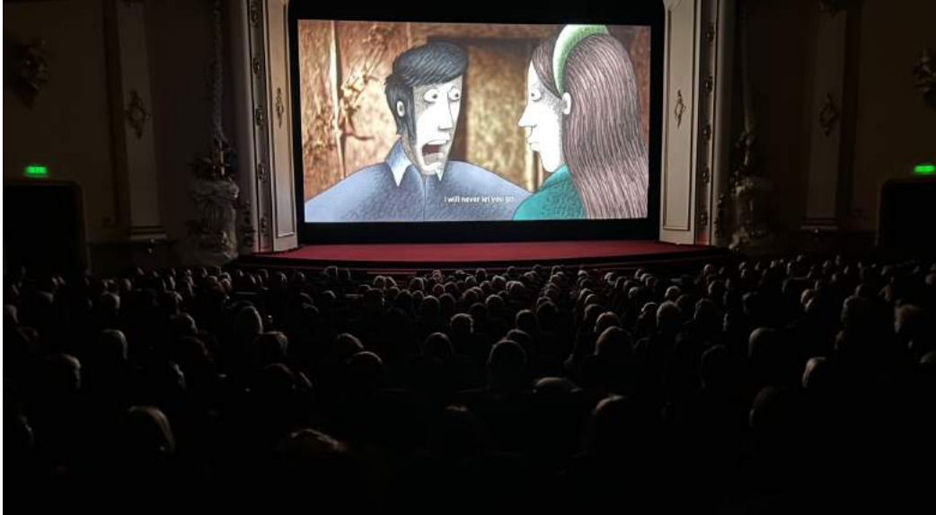
Opening film of Riga International Film Festival, October 2022