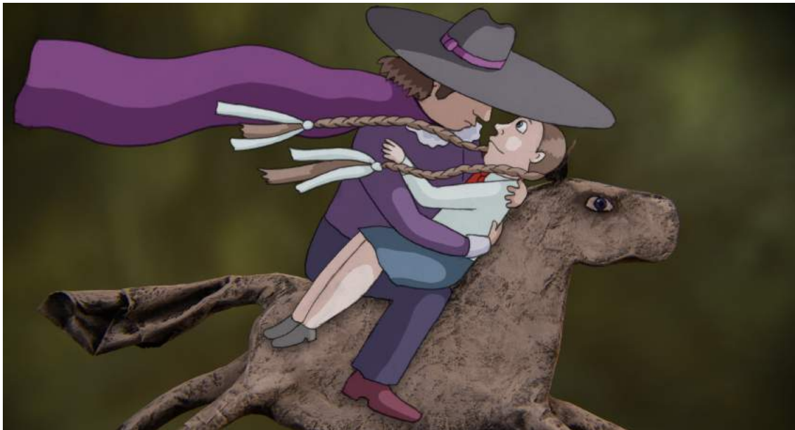
Zelma and her Imaginary Lover

Why do Zelma's perfect relationships keep falling apart?